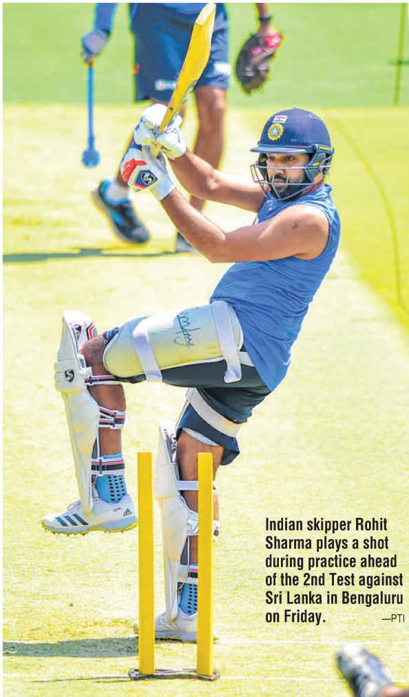
Indian skipper Rohit Sharma plays a shot during practice ahead of the 2nd Test against Sri Lanka in Bengaluru on Friday.

Pacer Suranga Lakmal, playing his last series, was the only one among the six bowlers, who managed an economy of under-4 runs. Others were pretty expensive with every Indian batter going after them, especially Rishabh Pant (96) and Ravindra Jadeja (175).