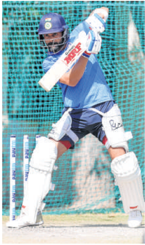
Virat Kohli's last scored a century in a pink-ball Test against Bangladesh

Batting against a below-average Sri Lankan attack in a comparatively small ground is actually a perfect opportunity